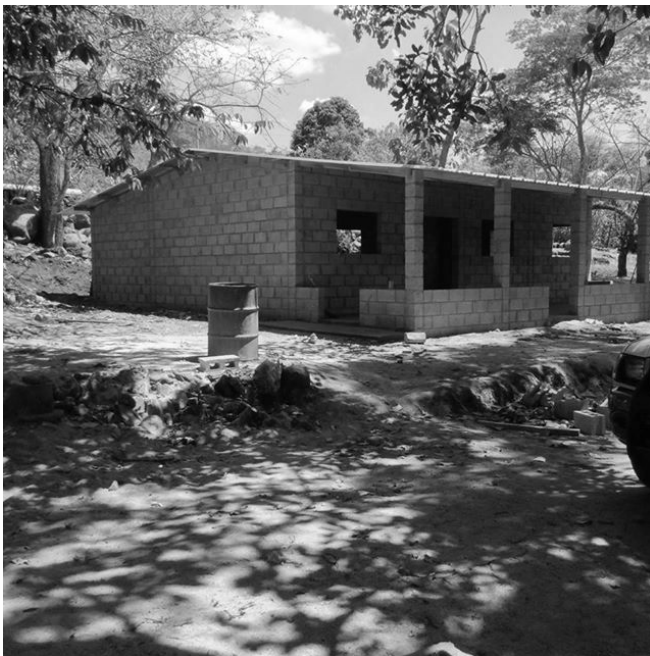
Cal Pipil, a youth centre founded by Emanuel Baptist Church